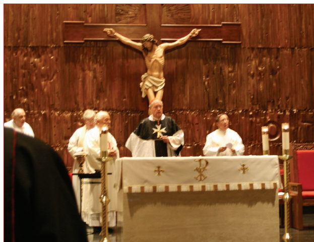
Cardinal Egan, Our Lady of Philermo