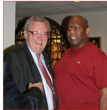
Grand Master & Resident

challenges of daily life. Just like one could take bottles of water home from Lourdes, I wished there was a way to bottle the inner healing of Lourdes that takes place during every pilgrimage and share it with the Malades in Spirit and the knights and dames who were unable to make the trip so that they may receive an inner healing too, and in the case of the latter, so that the ties that bind the Order together may be strengthened.